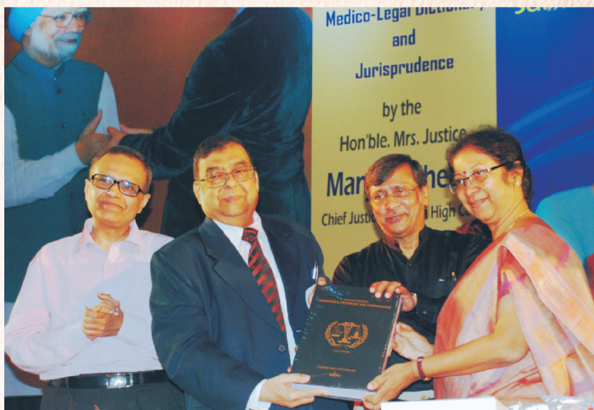
Release of the Dictionary on November 28, 2015 at Calcutta